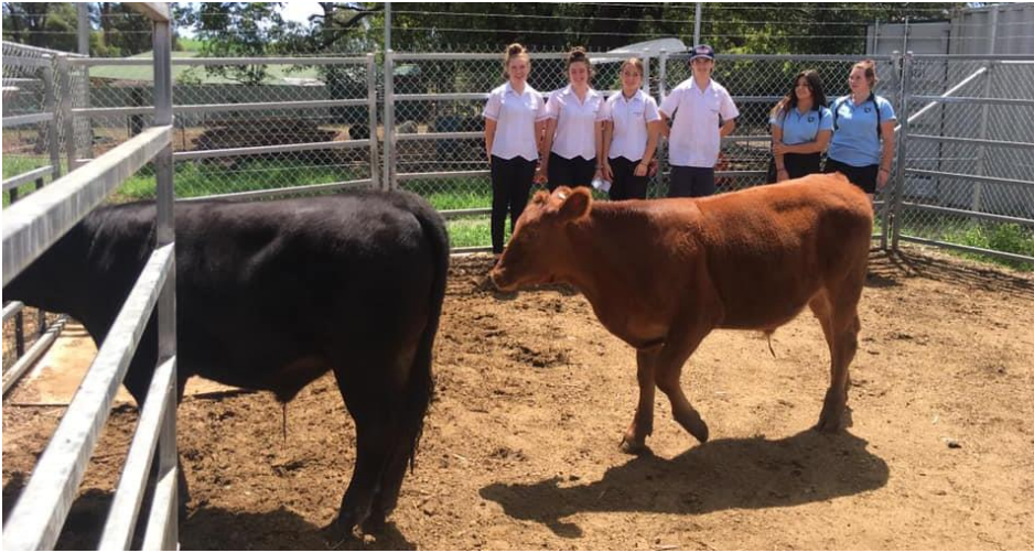
(Kildare 145 (316 kg left) and Kildare 126 (256 kg right) arriving at Picton High, 20 February 2020)

Within 4 weeks of delivery of the steers, the pandemic lockdown was in force, and schools shut down. Our greatest concern was that the cattle would need to continue to be fed. One school withdrew and those steers were immediately collected, but all