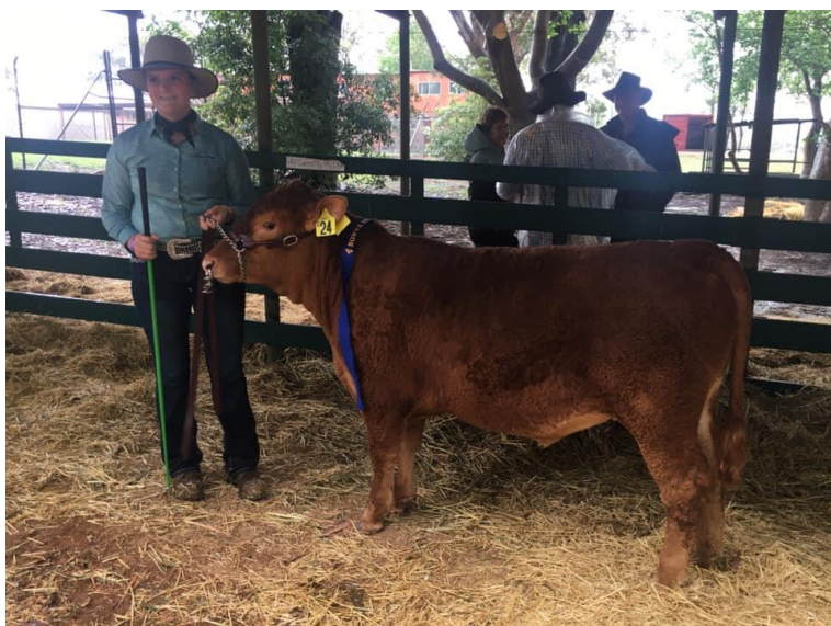
(Tannoch Q24 at the Nowra Show, 8 February 2020)

Bomaderry High already had two steers from Tannoch Farm for the local shows, and they only were shown twice, in Nowra and Milton. Bomaderry kept the lighter steer Q24 for the Spectacular and returned the heavier steer Q25 to Tannoch for preparation as a parader, expecting him to be overweight for the medium weight class in May. Tannoch had the task of keeping Q25 on feed and training two heifers (Q26 and Kildare 8-240) as paraders (new ground for your correspondent).