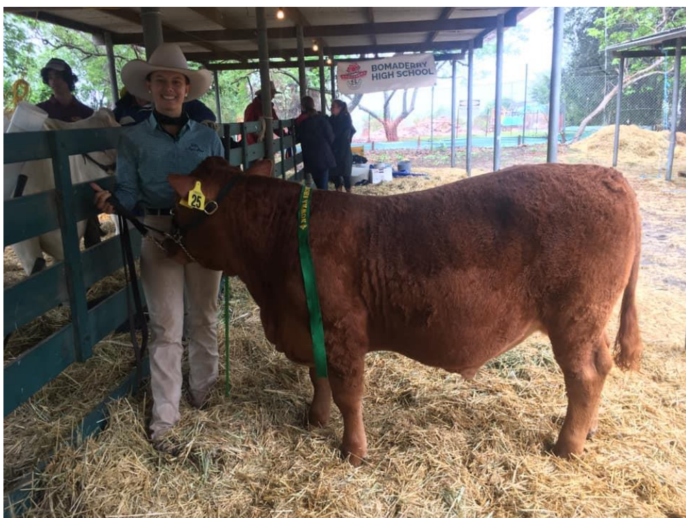
(Tannoch Q25 at the Nowra Show, 8 February 2020)

Bomaderry High already had two steers from Tannoch Farm for the local shows, and they only were shown twice, in Nowra and Milton. Bomaderry kept the lighter steer Q24 for the Spectacular and returned the heavier steer Q25 to Tannoch for preparation as a parader, expecting him to be overweight for the medium weight class in May. Tannoch had the task of keeping Q25 on feed and training two heifers (Q26 and Kildare 8-240) as paraders (new ground for your correspondent).