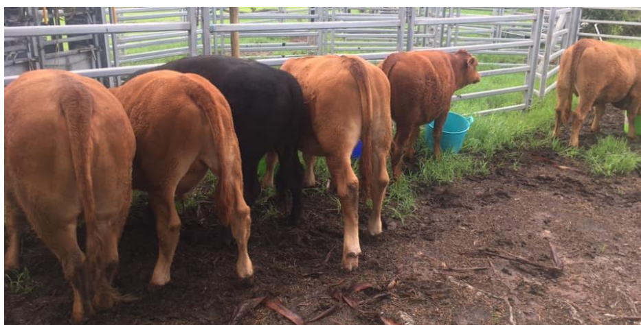
(4 x Kildare Steers, 1 x Kildare heifer, 1 x Tannoch heifer @ Tannoch Farm on 10 February – the fires were gone, and the creek was flooding)