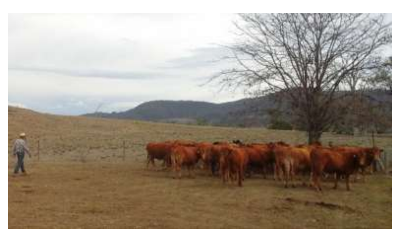
Photo Above is the team having a smoko break either during or after the vet checking of the heifers.

On the left is a photo of the heifers which were relocated to Tasmania.